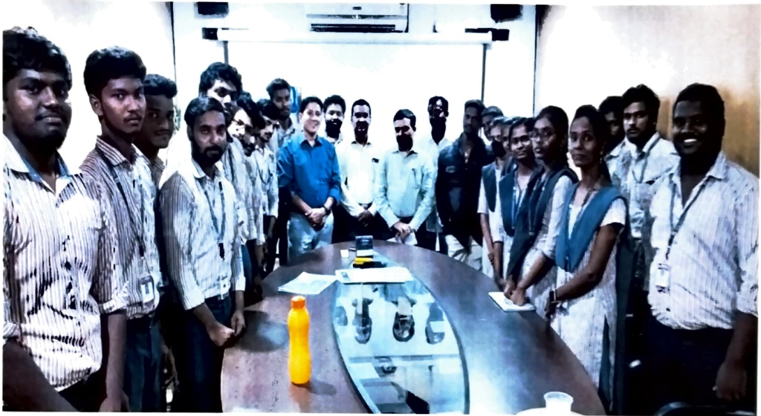
Photographs Taken at Sri Pipes and Fittings, Rajamahendravaram